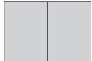
Double Page Spread

For legibility, we recommend that any text for the Full Page or Double Page Spread advertisements is placed at least 10mm from the top, bottom and outside edges of the artwork and at least 20mm from the edge nearest the spine.